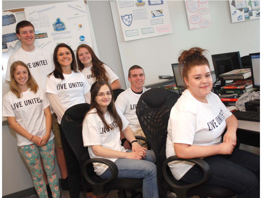
Students from the Business Club at Laconia High School's Huot Technology Center