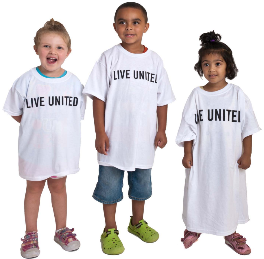
Children from Lakes Region Child Care Services